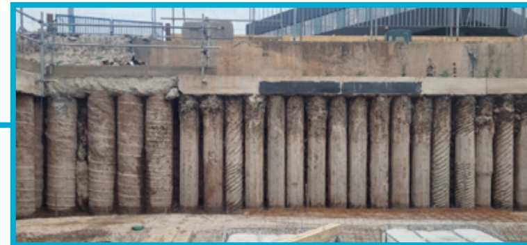
Photos showing Sprayed concrete works Secant Pile Wall, Royal Victoria Hospital, Belfast.