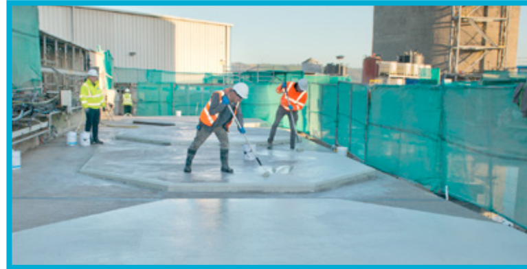
Photo shows application of chemical protective coating Brenntag, Belfast.