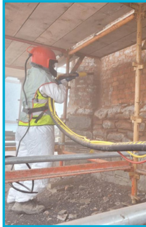
Photos showing brickwork preparation at Donaghadee Gunpowder Store.

Abrasive blast cleaning is the most comprehensive method for the removal of dirt, coatings, corrosion and paint finishes on steel, masonry and concrete surfaces. The method involves the use of high-velocity abrasive particles from a jet stream of compressed air or centrifugal impellers to 'blast' clean the steel surface.