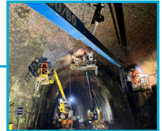
Photos showing resin injection works progressing at Cork tunnel Kent station, Cork.