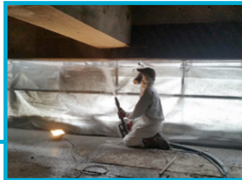
Photos showing an airtight encapsulated work area at Coolerry railway bridge, both during and post grit blast cleaning.